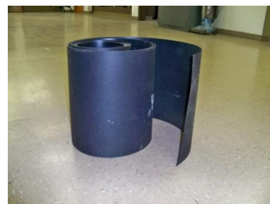
100-foot rolls in custom depths 12-inch depth shown here

The success of the installation depends on the tree species, soil conditions, available space and site design. Place the textured side of the barrier towards the roots to be deflected. Leave top edge \frac{1}{4} ' above finished grade.